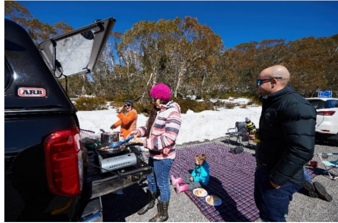
Picnic in the Dingo Dell carpark

Dingo Dell Café will operate 10am – 4pm, Wednesday to Sunday and everyday of the school holidays. (when there is snow). When the café is closed the building will remain open for visitor use. Ranger staff patrol the area during the day but are not guaranteed to be always there.