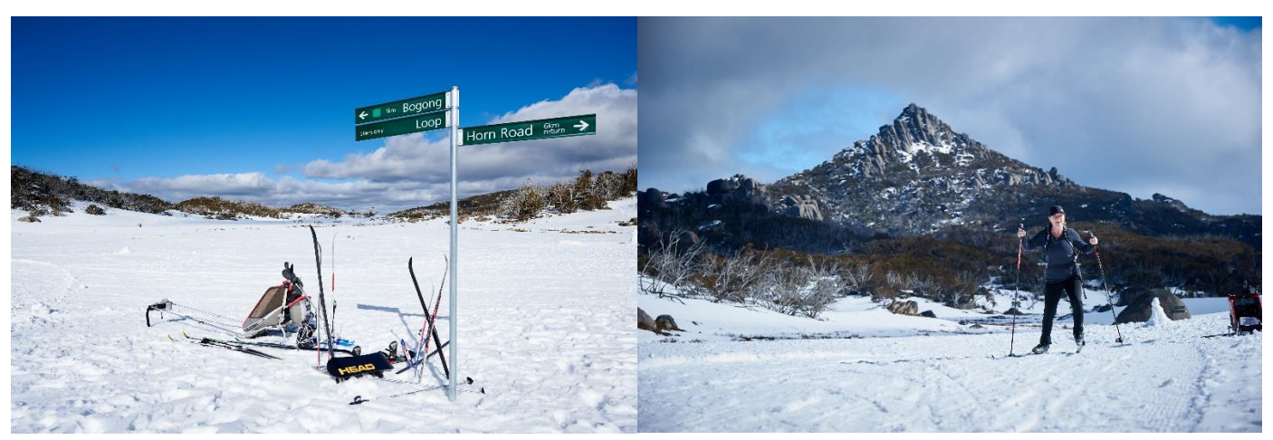
The start of the Bogong Loop at Cresta Valley