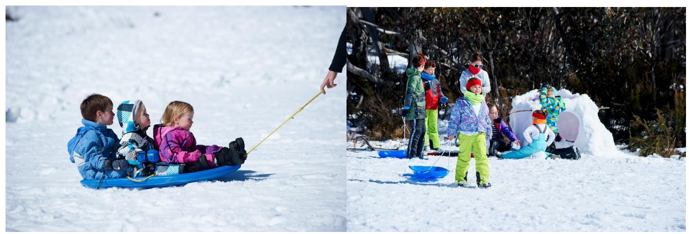
Tobogganing fun Snow play