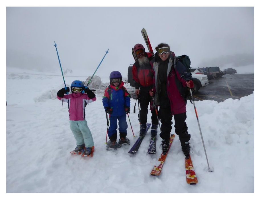
A day at Cresta Valley backcountry skiing and snowshoeing. Dress warm as not all days are sunny.

Cresta Valley is serviced by a small car park area, with additional parking along the road, a long-drop toilet and a small non-heated room to change in or to escape the weather. Ranger staff patrol the area during the day but are not guaranteed to be always there. Telstra is the only mobile phone service provider on the mountain. An aerial booster has been installed to improve Telstra coverage at the site but weather can impair reception.