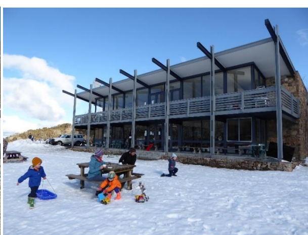
Keown Lodge & Dingo Dell Cafe